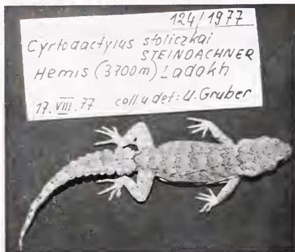
Figure 1. Cyrtodactylus stoliczkai (ZSM 124.77), adult female, with unregenerated tail.

T. mintoni , T. chitralensis , T. stoliczkai and T. kirmanensis ; the genus Cyrtopodion Fitzinger, 1843 is resurrected as a second subgenus to include four Pakistani forms: agamuroides , scaber , watsoni and kachhensis . A third subgenus Mediodactylus is left floating (Golubev, pers. comm., 1996).